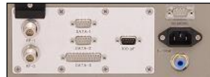
Connectors of TC-5901B